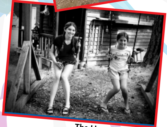
The Houser Grandkids

We LOVE our North Idaho Family Magazine KIDS! - Local kids, doing local activities, having fun, learning, making stuff, etc. We feature 2-3 families in each issue. Email community@nifamily.com for more information or to send your high-resolution Kid Pics for the next issue!