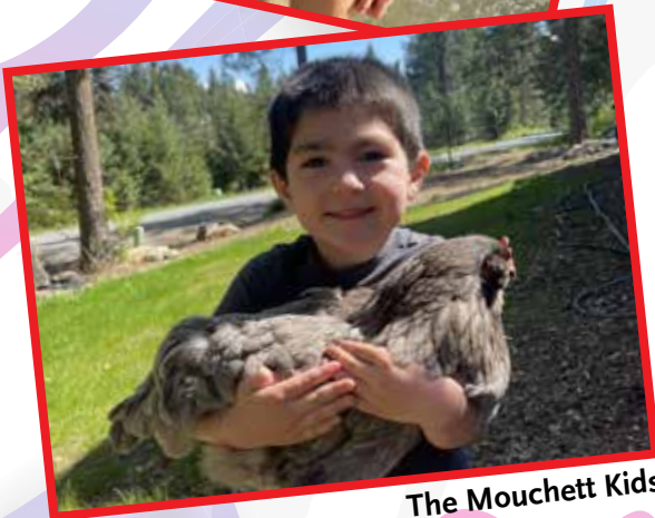
The Mouchett Kids